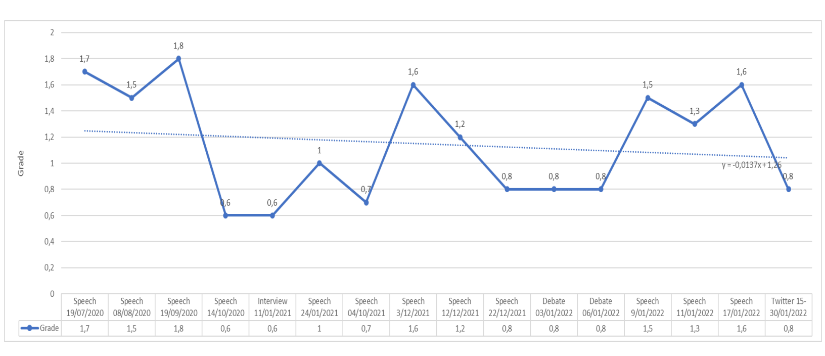
FIGURE 1 – Collection of speeches (including tweets)